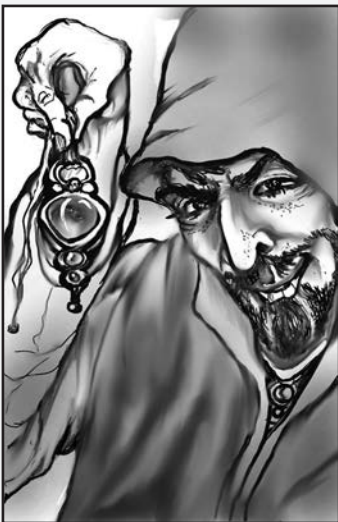
The magician used special jewels or words to command the spirits.

The evil spirits that worked in Paul’s day continue to work today. In what ways do we see them at work? What can we do to make sure we don’t give them any control over us?