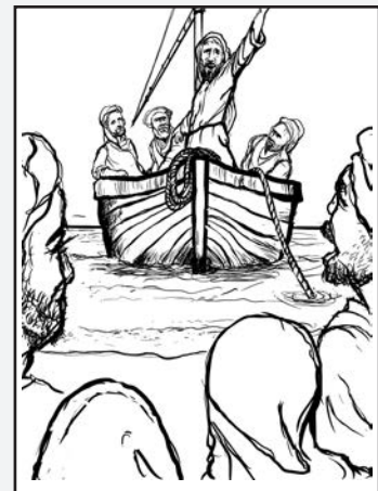
Jesus preached His powerful sermon about the Bread of Life. Jesus talked about the gift of everlasting life, too.

Without Jesus, we don’t have everlasting life. After we accept Jesus and get the promise, we continue living as humans who will sleep when we die. At the Second Coming, Jesus will resurrect or wake us up from the dead. Then He will give us the gift of everlasting life. The gift is promised to us now. We have this gift, but not because we have spirits that never die. Jesus gives us this gift because of our faith in His mercy.