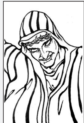
Jacob made Joseph a special coat that was long and beautiful (Genesis 37:3).

Read Matthew 20:26, 27. What important Bible truth do we see in these verses? How can we live this Bible truth?