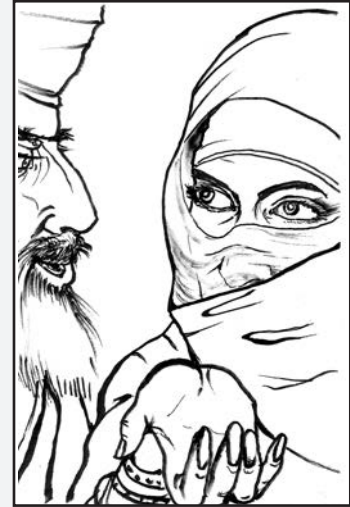
Tamar is the first of four women on the family list of Jesus.

This story ends when Tamar gives birth to twin boys. One son is named Perez. In the Hebrew language, Perez means “breaking through.” Perez is born second, the same as Jacob. But Perez becomes first as Jacob did. He becomes the future father of the family line of David (Ruth 4:18–22) and of Jesus (Matthew 1:3). Tamar is the first of four women on the family list of Jesus. There are Rahab (Matthew 1:5), Ruth (Matthew 1:5, 6), and Bathsheba (Matthew 1:6), too. Just as God saves Tamar, He will save His people by the Cross of Jesus. God also will turn the troubles of Joseph into something good and save His people.