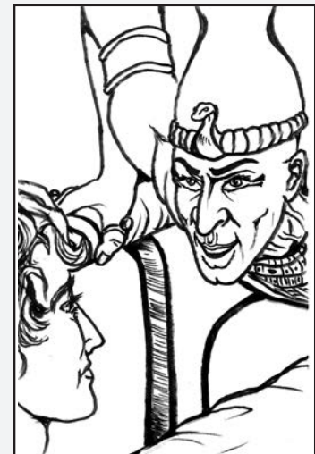
Pharaoh is upset by his dreams. He tells his dreams to Joseph (Genesis 41:14–24).

How can we learn to trust God and His promises when bad things happen? What should we do when we feel that God does not hear our prayers?