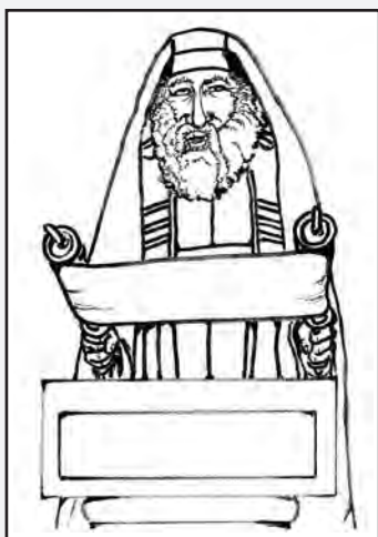
Priests also taught the law of God to the people.

Read Leviticus 1:1–9; Leviticus 10:8–11; Malachi 2:7; Numbers 6:22–26; and Hebrews 5:1–4. As these verses show, what is the job of the priest?