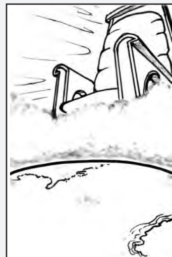
Jesus is now the lawful King of this earth.

Now that you know Jesus is the King of heaven and earth, how does this Bible truth help you during hard times?