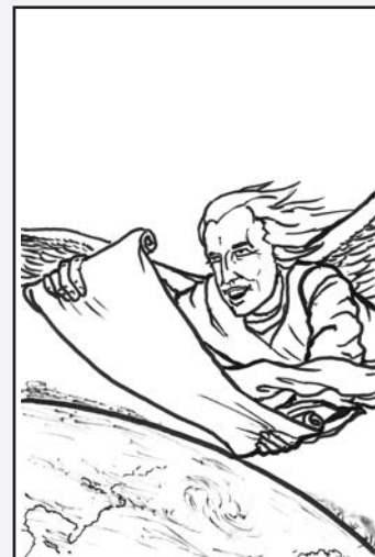
The Three Angels’ Messages show us our job at this time in history.

Read Revelation 14:11. This verse shows us the people who worship the wild sea animal and his statue. The people who worship this animal have no rest. Why is that?