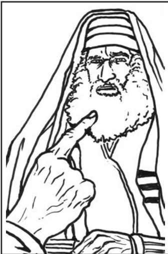
Jesus names the Jewish religious leaders hypocrites.

Hypocrites are people who want us to believe that they are better than they really are. Hypocrites are fakes. They live a lie. Their private lives do not match what we see in public. So, hypocrites have a “private face” and a “public face.” The public face is the face they show us. The private face is the person they really are. Jesus says the word “hypocrite” seven times in Matthew 23. Jesus names the Jewish religious leaders hypocrites (Matthew 23:13, 14, 15, 23, 25, 27, 29). The New Testament stories about Jesus show how He offers forgiveness to sinners. Many of these sinners are married people who cheated on their husbands or wives, tax collectors, women who sell sex for pay, and even killers. Jesus shows them mercy. But Jesus does not show a lot of mercy to hypocrites (read Matthew 6:2, 5, 16; Matthew 7:5; Matthew 15:7–9; Matthew 22:18).