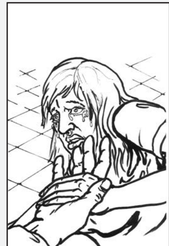
Jesus invites us to trust Him when we feel low.

Jesus promises us: “ ‘I will come back. Then I will take you with me, so that you can be where I am’ ” (John 14:3, ERV). What does this promise show us about how important the Second Coming is? Why is this promise so precious?