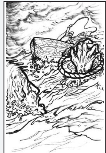
The man in the water must agree to grab the rope.

Here is a picture story to help explain the special agreement. A man falls off a boat during a storm. Someone on the boat says he will throw a rope to the man in the water. But the man in the water must agree to grab the rope. That is how the special agreement between God and sinners works. We must accept what God gives us to save us.