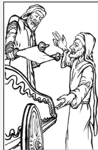
The Spirit led Philip to a powerful Ethiopian who was searching for the truth.

What can we do, day by day, to make ourselves more open to the Holy Spirit's power? Also, what choices can we make that will let the Holy Spirit work in us to help other people?