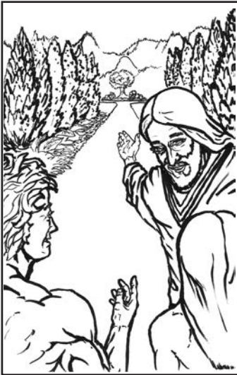
In Genesis, God puts humans in a garden.