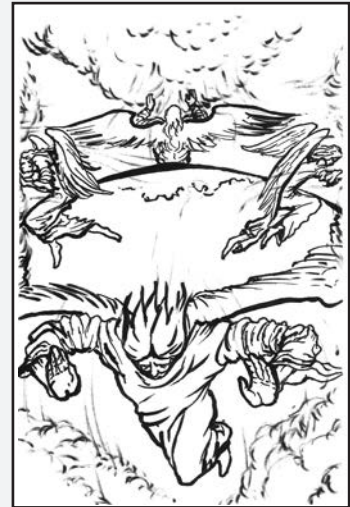
The four winds are word pictures for the four directions: north, south, east, and west.

Job 26:7 (ERV), shows us that the earth hangs in space: “ ‘God stretched the northern sky over empty space. He hung the earth on nothing.’ ” The earth’s shape is the same as a “ ‘circle’ ” (Job 26:10, EXB). It is not flat. Isaiah 40:22 (ICB), says: “God sits on his throne above the circle of the earth. And compared to him, people are like grasshoppers. He stretches out the skies [all the space above the earth; the sky] like a piece of cloth. He spreads them [the sky] out like a tent to sit under.”