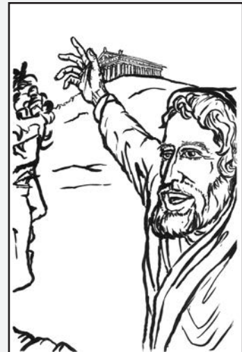
Paul tells the men in Athens that God is the One who made the earth “and everything in it” (Acts 17:24, ERV).

Jesus and all the New Testament writers talk about Genesis 1–11 as history that is true. Jesus talks about Moses’ writings and about the time when God made Adam and Eve (Matthew 19:4). Paul tells the men in Athens that God is the One who made the earth “and everything in it. He is the Lord of the land and the sky. He does not live in temples built by human hands” (Acts 17:24, ERV). The New Testament writers built their teachings on the Bible truth in Genesis. In this way, these writers show the modern readers that God’s work in Genesis 1 and 2 is important.