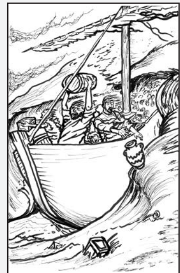
The ship gets trapped in a very bad storm. The sailors start throwing wood boxes and other things into the sea.

Paul is a loyal servant of God. But he suffers so much. Why? What can we learn from Paul's experiences?