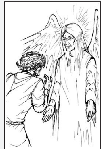
An important part of Gideon’s strength was his own sense of unimportance and weakness.

Why did the Lord choose to use sinful and weak humans in the course of this rescue? Could He have not Himself called “more than twelve legions [large groups] of angels” (Matthew 26:53) to do what was needed for Israel at that time? What part do we as sinful humans have in both the great controversy and the spreading of the gospel?