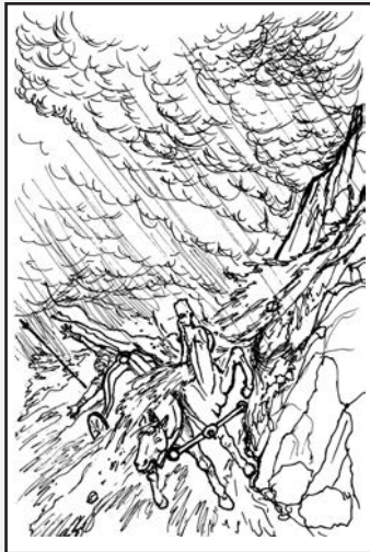
Heavy rain sweeps Sisera's soldiers away.

Read Judges 4. In what ways do we find the great controversy theme explained here? In the end, who alone brought victory to Israel, even though the people were unworthy?