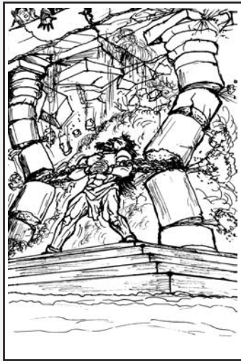
Samson pulled down the temple of the Philistines.

The battle lines between good and evil are blurred in the story of Samson. Samson's life has a strong start, with an announcement from the Angel of the LORD that he is to be a Nazirite 2 from birth. The Angel teaches Samson's parents how to prepare for their special baby. The mother is told not to drink alcohol or to eat forbidden food (Judges 13:4, 13, 14; read also Leviticus 11). God had special plans for Samson. But, sadly, things did not work out as well as they could have.