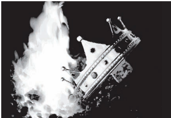
Getting reading for Jesus' coming means laying up treasure in heaven.

There are many temptations in today's world, from TV or movies to mood-changing drugs. So, with these verses Paul is begging us through the halls of time: keep away from temptations. Put the Word of God first in your life. Then you will not be surprised by events, no matter how unexpected they may be.