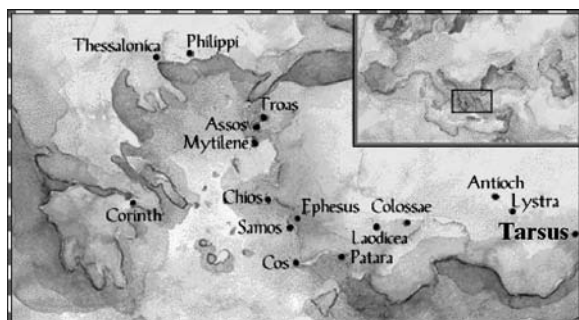
Paul was born in Tarsus, the chief city of Cilicia, in what is now Turkey.

Paul was born in Tarsus, then the capital of Cilicia. It was a Roman area, which is now present-day Turkey. This area was well-known for its goats'-hair cloth. The goats'-hair cloth was widely used for tent making, Paul's trade (Acts 18:3).