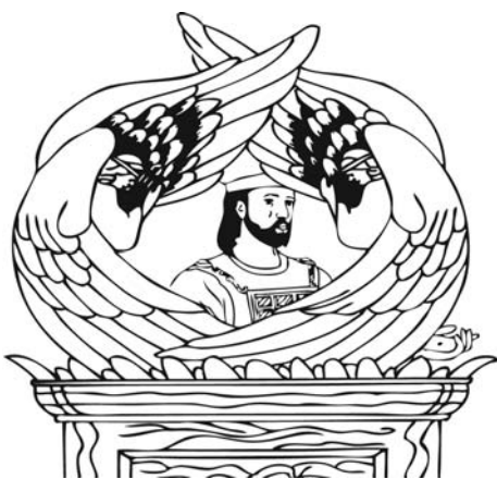
Jesus appears for us in the presence of God as our High Priest.

4. Christ shed His blood once for our sake. And now He appears for us in the presence of God as our High Priest. (verses 24–28).