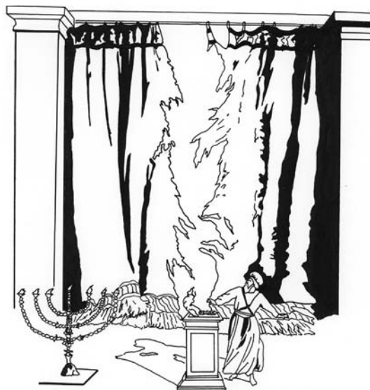
The inner veil (curtain) of the temple was torn from top to bottom by an unseen hand.

Many Christians today are looking toward the rebuilding of the temple in Jerusalem as a sign of the end. Suppose such a temple were rebuilt, and sacrifices were made again. Why would those sacrifices fail to work in dealing with the sin problem?