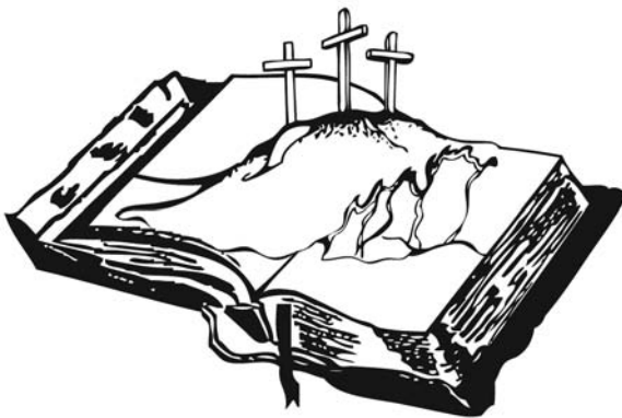
The Cross helps us to understand Bible truth.

The Bible books come in different styles and forms. But they all speak about a loving God, who is the Creator of the universe. They all speak about how He reaches out to sinful people. The theme of God's love is the focus of every book in the Bible. This is seen especially through Christ, who came into this world, lived as a man, and died on Calvary. This is the greatest truth of the universe. All Bible truths should be studied from the truth of Jesus' cross.