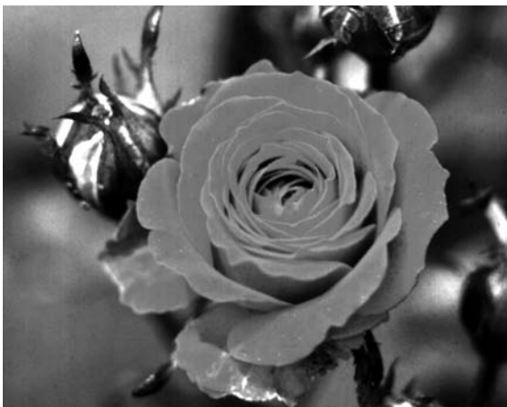
God shows His love to us through nature.

These verses clearly show that God never planned for us to be doubtful about the purpose of life. God made sure we could know the truth and the way of salvation. God shows Himself through nature, science, the Bible, Jesus, His leading in our lives, our relationships, and the Holy Spirit. He also shows Himself through God's image (likeness) reflected (shown) in people who have dedicated (given) their lives to Him.