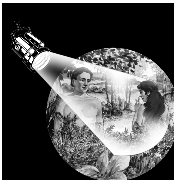
Genesis 2 is all about Adam and Eve.

In Genesis 2, the scene changes from the Creation of the world to a local garden. This is not a second and different Creation story. Instead, Genesis 2 is an addition to Genesis 1. Humans are at the top of the pyramid in Genesis 1. In Genesis 2 they become the center of a circle. The spotlight falls on the human race.