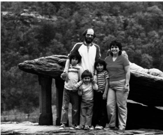
We are happy when we are learning about God through what He has created.

“The home of our first parents was to be a pattern (example) for other homes. Their children were to go forth to take over the earth. The home was made beautiful by the hand of God Himself. But it was not a beautiful, expensive palace. . . . God placed Adam in a garden. . . . In the surroundings of the holy pair was a lesson for all time. The lesson is that true happiness is found, not in pride and wealthy living. Instead, happiness is found in fellowshiping with God through His created works. . . . Pride and ambition are never satisfied. But those who are truly wise will find great pleasure in enjoying the things