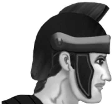
The soldier's helmet symbolizes Christ's salvation.

Satan often makes us doubt our salvation. But we do not need to fear. As long as we remain in Christ and wear the helmet of salvation, He is our safety and hope (John 6:37-39; Romans 8:31-39; 1 Peter 1:3-10)!