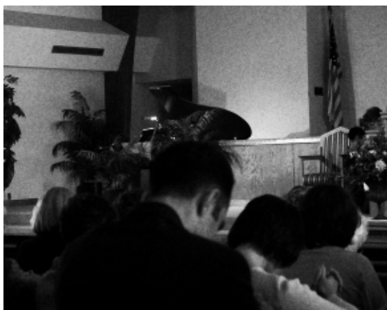
Having reverence for God is walking in love.

How does Paul describe what it means to be “unwise”? Ephesians 5:17. How do the following verses help to answer that question? Psalm 111:10; Proverbs 1:7; Isaiah 33:6.