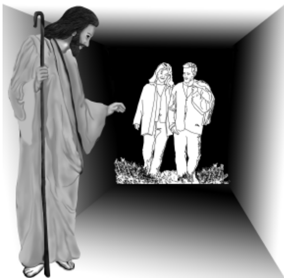
We walk from darkness into light.

Darkness stands for life before a person becomes a Christian. Light stands for life after a person becomes a Christian. Paul recognizes that believers have moved from darkness to light (Ephesians 5:8). Since they were converted, they have become light in the Lord. They reflect Jesus' character. Jesus said, "I [Jesus] am the light of the world" (John 8:12).