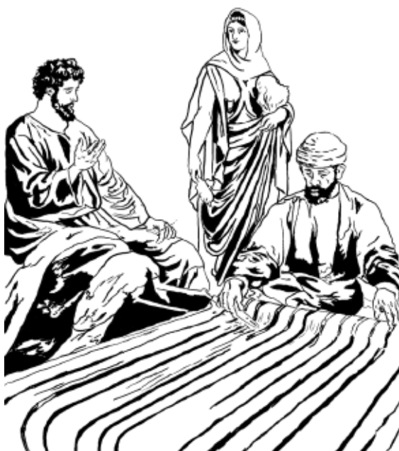
Paul supported himself by making tents.

Paul left the Ephesian church under the care of good leaders (Acts 20:17). Paul also chose Timothy to work in Ephesus. Paul told Timothy “not to teach things that aren’t [are not] true. Command them [the Ephesian church members] not to spend their time on stories that aren’t true. They must not waste time on family histories that never end. 11 Things like that cause people to argue instead of doing God’s work. His [God’s] work is done by faith” (1 Timothy 1:3, 4, NIV).