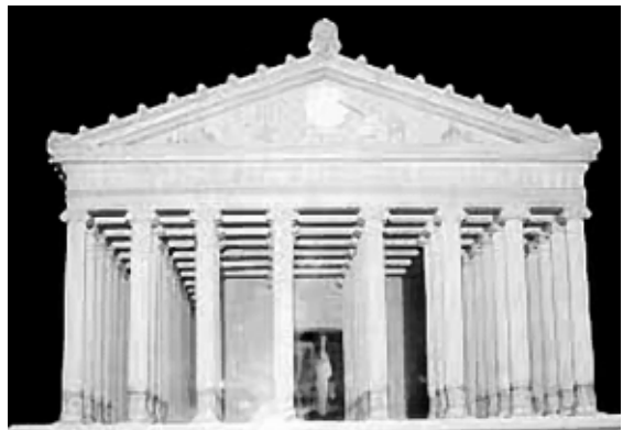
The temple of Diana.

ble. It was lined with gold. The temple measured 425 by 230 feet. The statue of Diana was in the center of the temple’s sanctuary. During Paul’s time, Diana’s temple was one of the seven wonders of the world. Ephesus’ trade, industry, and economy depended on the huge crowds that came to worship Diana.