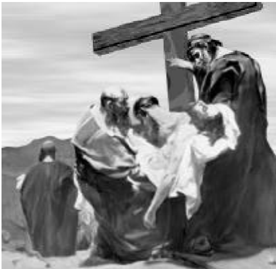
Jesus died for everyone.

The Bible does not know about relativism. Relativism is each person trying to give his or her own version (idea) of “truth.” There is only one God, one Creator, one Savior, one Lawgiver, and one way of salvation. As Christians, we believe that all the world is fallen into sin. We also believe that at the Cross, Jesus accepted the sins of all people upon Himself so that all who accept Him by faith could be saved. So it is hard to see how there can be different truths for different people. The truths of the Bible about creation, salvation, and sin, are the same everywhere and include everyone. Knowing these truths, we do not have a good reason to believe that any other religious idea is good, even if people who believe that idea are sincere and loving.