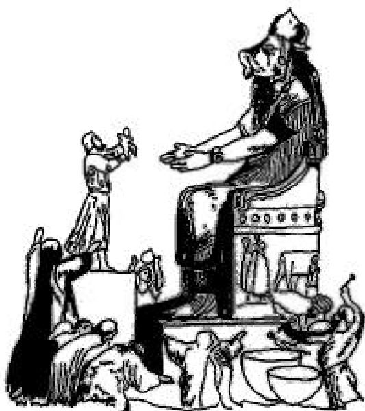
The Israelites worshiped idols even though God told them not to.

Jonah 1:3 tells us twice that Jonah “went down” (KJV). Jonah 1:5 also tells us that Jonah “went down” (KJV). Jonah “went down” to Joppa. Jonah “went down” into the ship. Jonah had “gone down” into the lowest parts of the ship. So the writer carefully builds the story to focus on Jonah’s downward journey away from God’s will. Before it is over, Jonah goes down much farther than he imagines he will. This is because he