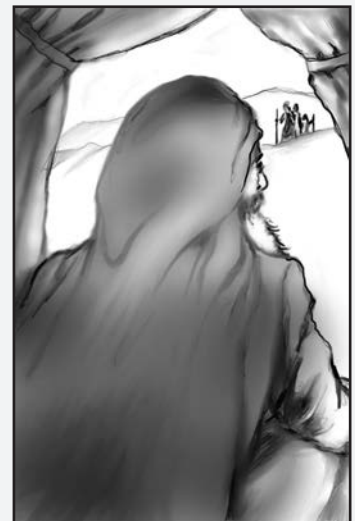
While Abraham sat in the doorway of his tent, he saw three travelers.

Think about Abraham's example of hospitality. How can you show this same hospitality to the people in your life?