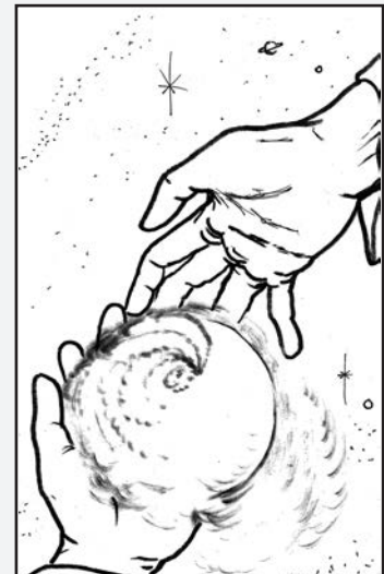
God made a plan to save us before He made the earth.

God showed us on the cross how much He loved us. Why should this Bible truth fill our hearts with joy?