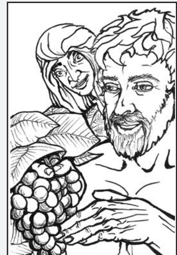
God cares about the needs of the man and the woman.

The Bible shows us that God wants to be close to humans before sin happened. We also can see that God wants to be very close to humans after sin came. What did you learn today that helps you understand how much God wants to be your Friend right now, too?