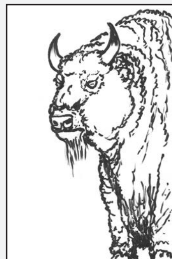
The new wild animal power shown in Revelation 13:11, 12 is a word picture for the United States of America.

Revelation describes the wild animal power that came from the ground. This animal has two horns that look the same as a lamb’s horns (Revelation 13:11). These two horns are a word picture for something gentle. But the lamb will talk “like [the same as] a dragon” (Revelation 13:11, ERV). This verse tells us about a time when this power will attack God’s people in the same way the Catholic Church attacked God’s people in the past. Revelation 13:11–17 answers the question: How will the Catholic Church again have the power it had in the past? The answer: the Catholic Church will have the power of the United States behind it. That is how.