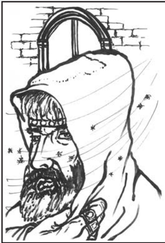
The pope made Henry wait outside in the cold winter for three days.

How can we share the truth about the Catholic Church in a loving and kind way with other people?