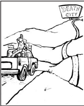
Serving sin leads us to death.

Paul also comes back to the word picture of sin as a mean master. A master must be obeyed. As we learned, a person must choose to serve one of two masters. He or she can serve sin. But serving sin leads to death. Or a person can choose to serve God. Our serving God leads to our being made right with Him and to everlasting life. Paul makes it clear that we must choose between one side or the other—sin or God. In the end, we must choose either everlasting life or everlasting death.