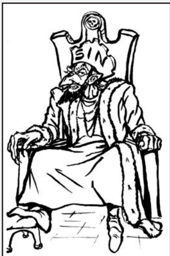
Paul warns us that sin tries to rule over us as a king.

Paul warns us not to let sin “have power over” (NLV) our bodies or to let sin “rule” (NlrV) them. These wordings show that “sin” is the same as a king. The Greek word written as “have power over” and “rule” means “to be a king” or “to act as a king does.” Paul is saying that sin is all too willing to rule as a king over our bodies and control everything we do.