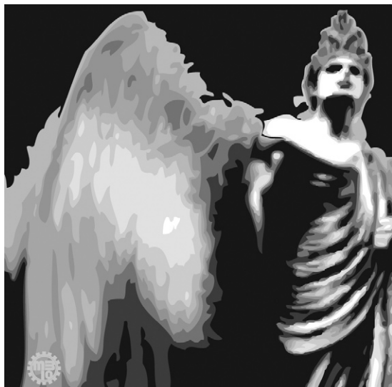
Lucifer, the leader of all angels, was robed in great glory.

Imagine yourself wearing a garment (robe), or covering, made perhaps of rubies, diamonds, topaz (yellow jewel), beryl (green, yellow, or pink stone), onyx (black and white stone), jasper (green stone), sapphire, emerald, chrysolite (yellowish-green stone), and turquoise (blue-green stone) framed with gold. We might try to imagine the colors of Lucifer’s covering (robe) (red, yellow, green, azure blue [color of the clear blue sky], turquoise, olive green). As the leader of all angels, Lucifer, was robed in great glory. And with the highest position among them, Lucifer must have had the respect and love of all the other angels.