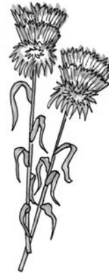
After sin entered the world, thorns and thistles grew.

The pollution of air and water, the spoiling of soil, the presence of new and fearful diseases point to the aging of the earth and the growing need for renewal. As more and more countries try to improve their standards of living, the health challenges become greater because of the damage done to the environment.