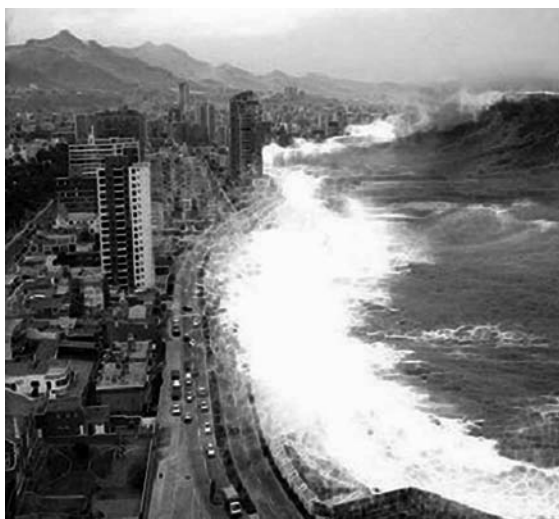
The results of sin can be seen in nature.

These facts raise many difficult questions. Should we as people carry any responsibility for these things? Should we accept any guilt for this group condition of sinfulness? The following points may help us to deal with this problem.