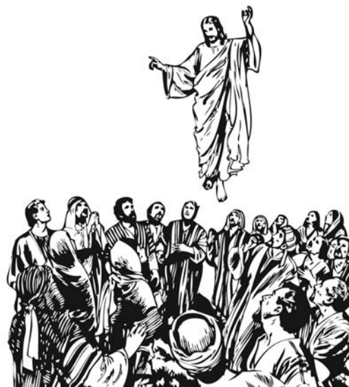
Jesus promised His followers that after He returned to heaven He would send them the Holy Spirit.

and godliness and judgment" (John 16:8, NIV). This is common grace. It is the work of the Holy Spirit to make sinful human beings (people) understand their sin, guilt, and separation from God. At the same time, the Holy Spirit points them to the Cross of Christ as the only way out of their hopeless way of life. Without this work of the Holy Spirit, the Cross would not work in itself. But because of the Cross the Holy Spirit is active in the world. His job is to always point sinners to Jesus for their salvation.