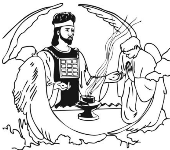
Jesus works as our High Priest before the Father.

It is perhaps for that reason that Hebrews 2:17 uses the verb 15 to make atonement (NIV) to show that the work of Jesus for us is taking place right now. This suggests Christ is working to restore (bring back) us to God. This means that on the cross Christ got salvation for all. But through His work as High Priest in the heavenly sanctuary, He is putting to use His “good work” on the cross for those who believe in Him. Without the work of Christ in the heavenly sanctuary, the atoning (cleansing) power of the Cross would not be available to sinners. Christ’s mediation (work in heaven) is rooted in the Cross. This mediation is not just in addition to Calvary. Instead, it is a very important part of the meaning of God’s forgiving power. It shows the deep and permanent atoning power of His death as our Sacrifice.