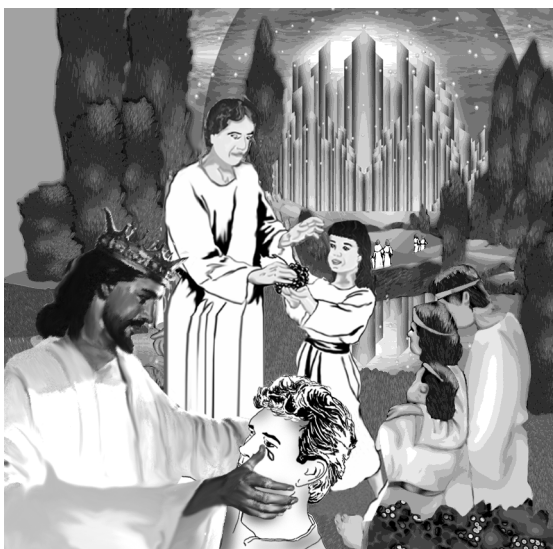
In heaven, there will be no more crying or pain (Revelation 21:4).

swept up in death. And, as one can guess, none of these philosophers has answered the problem. (Most of them are dead themselves.) Only Jesus has answered this problem through His death and His return to life. Jesus has shown us that death is not the end. He has shown us that we can one day be alive long after the cycles of life on this fallen planet have stopped (Isaiah 65:17). If not for that hope, Solomon probably would be right in showing his negative feelings.