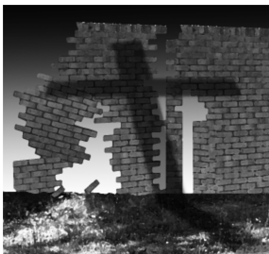
There are no more walls because of Jesus’ Cross.

What prejudices might you have that keep you from being part of Christ’s new creation? How can you get rid of those prejudices?