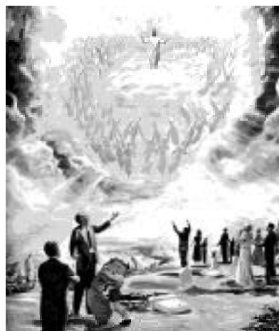
Victory over death comes with Jesus!

“Death is an enemy. But at the same time death is a defeated enemy. This means we can fight death with faith. We know death's victories will not last. We can be on the side of health, peace, and all else that promises life without feeling discouraged and fearful. We know that death will finally lose.”—Adapted from “Resurrection and Glorification,” Handbook of Seventh-day Adventist Theology (Hagerstown, Md.: Review and Herald Publishing Association, 2000), p. 364.