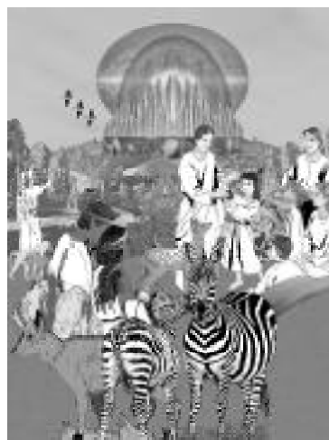
The new earth is a part of what God appointed.

Read Daniel 12:13. What Bible verses give you as much hope for salvation as Daniel received in this verse?